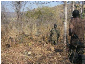
WAG scouts during ambush to arrest charcoal burners 19th