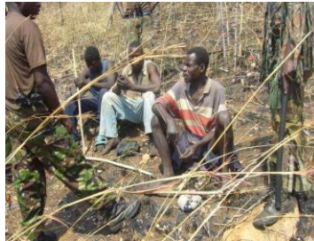
Arrested charcoal burners 19 th Sept 2010