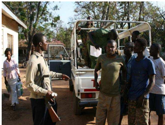
Arrival of known members of terrible attack of WAG scouts and base camp. Man to the right one of the main ring leaders.