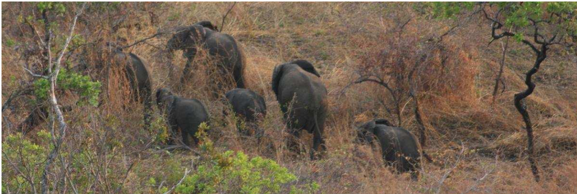
Some of Thuma elephants – near camp on the 8 th Sept 2010

Wildlife Action Group Malawi (WAG) has been based in the Thuma Forest Reserve since August 1996 and is dedicated to the protection of the reserves flora and fauna. WAG extended its presence into the Dedza-Salima Forest Reserve with assistance of Rettet die Elefanten Afrikas (REA, Save the African Elephant in Germany) to protect the elephants as they move from Thuma to Dedza-Salima away from Poachers. Since the beginning one of our greatest challenges has been to control the poaching within the reserve and we currently have 12 full time scouts who do daily patrols of the reserves. Over the last 18 months it has become increasingly obvious that there has been a dramatic shift in the types of weapons being used. The sounds of guns in the reserve has become a normal occurrence. An armed Game Ranger was immediately dispatched from Lilongwe and both him and our scouts were hot of the tracks of the poachers within 4 hours.