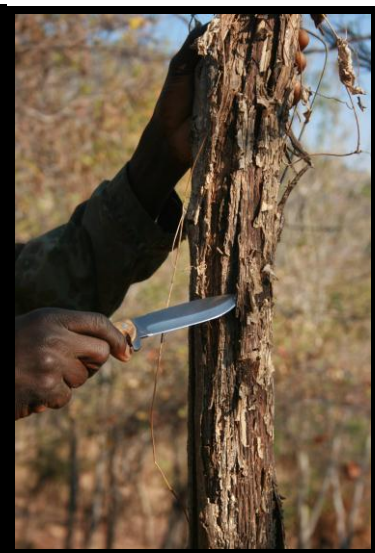
Hand crafted bush knives