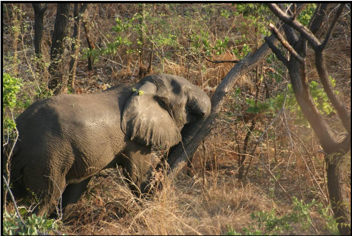
1. Chaka pushing down a tree near base camp