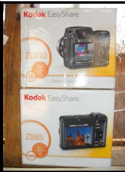
two great cameras