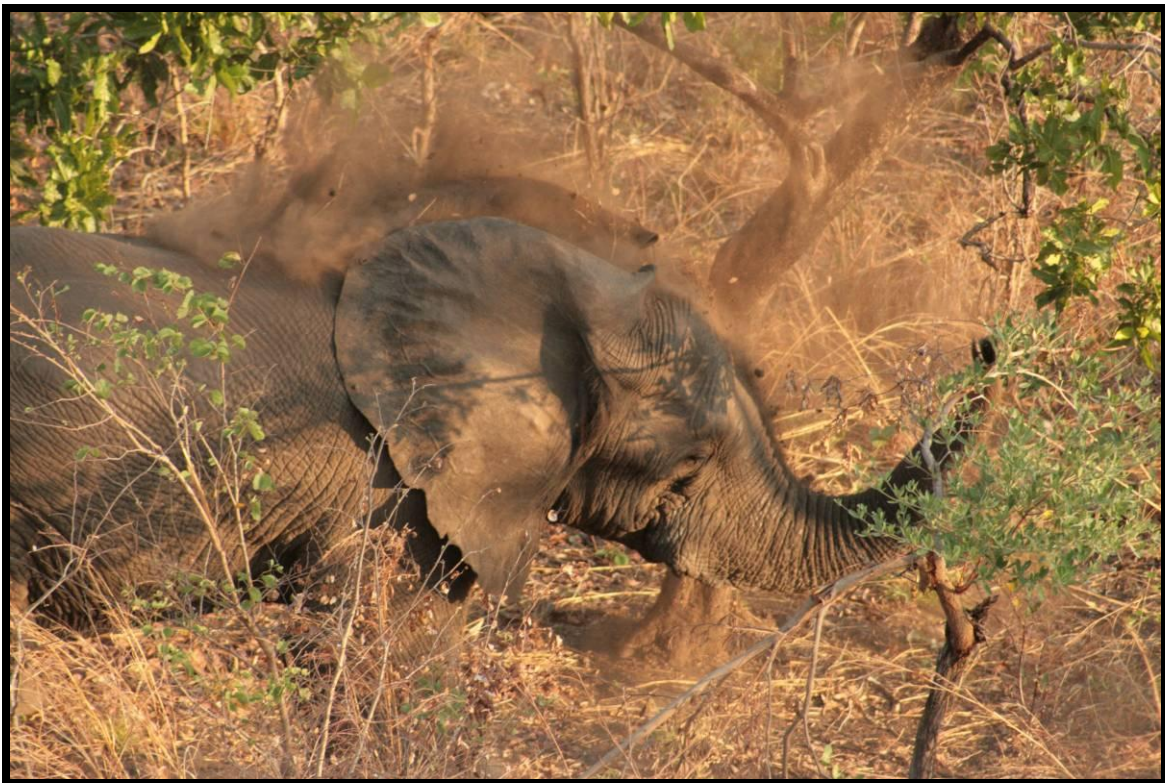
2. Chaka having a dust bath