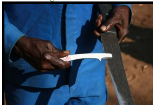
Knife sharpener great for all pangas and knives