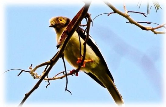
White crested helmet Shrike