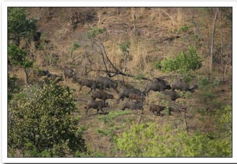
Herd of Buffalo spotted last Saturday.

Old "Tuskless" has been a regular visitor most nights last month. Sometimes he has one or two younger bulls with him but most of the time he is alone. He is huge and looks very old. He just hangs around camp at night and seems to enjoy us watching him early in the morning. I was delighted to hear the scouts saw him two days ago with a very large herd of females. The group comprised of over 40 and we could hear them trumpeting greetings to each other from camp! He hasn't been to camp since so must be walking with his friends and family.