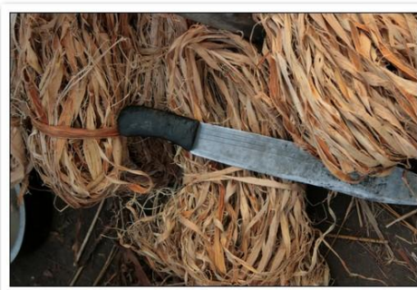
Rope from tree bark before being soaked in water