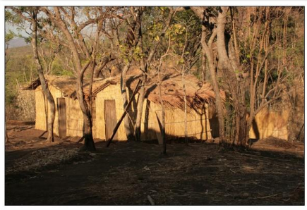
New houses looking fresh

Here are some photos of work in progress!