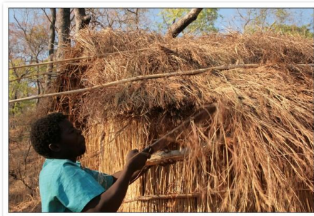
Tidying the roof – cut with panga and stick