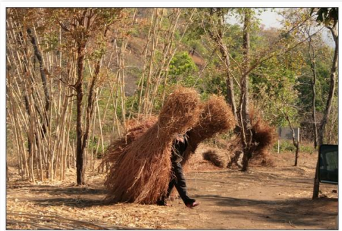
Thatch grass for the roof