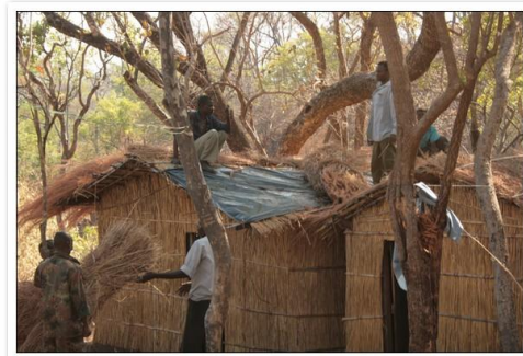
Black plastic used to waterproof roofs