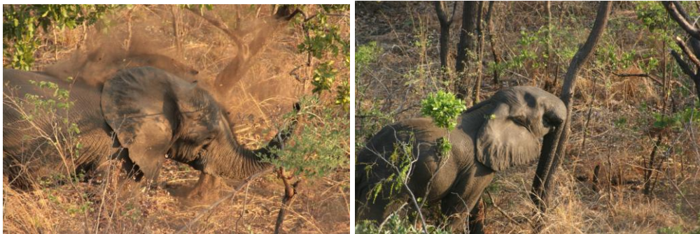
"Tuskless" – giving himself a dirt bath and then knocking a tree down

Old "Tuskless" has been a regular visitor most nights last month. Sometimes he has one or two younger bulls with him but most of the time he is alone. He is huge and looks very old. He just hangs around camp at night and seems to enjoy us watching him early in the morning. I was delighted to hear the scouts saw him two days ago with a very large herd of females. The group comprised of over 40 and we could hear them trumpeting greetings to each other from camp! He hasn't been to camp since so must be walking with his friends and family.