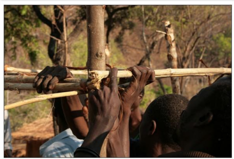
Using rope made from tree trunks