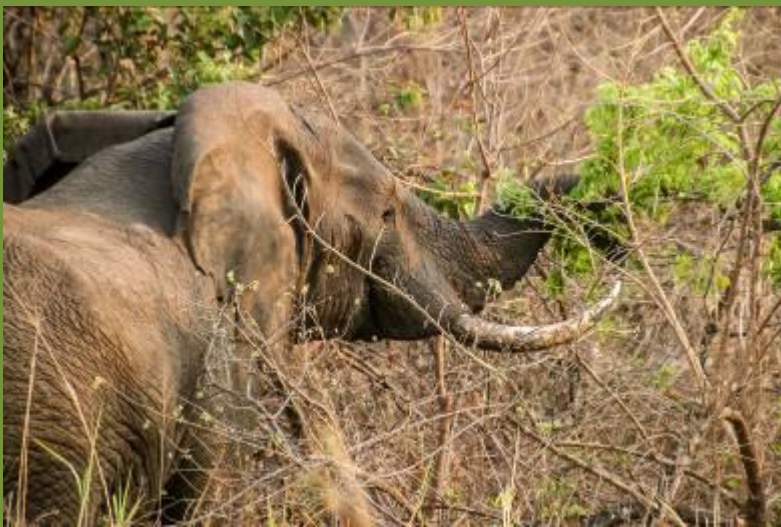
MOI ONE OF OUR MAGNIFICENT BULLS