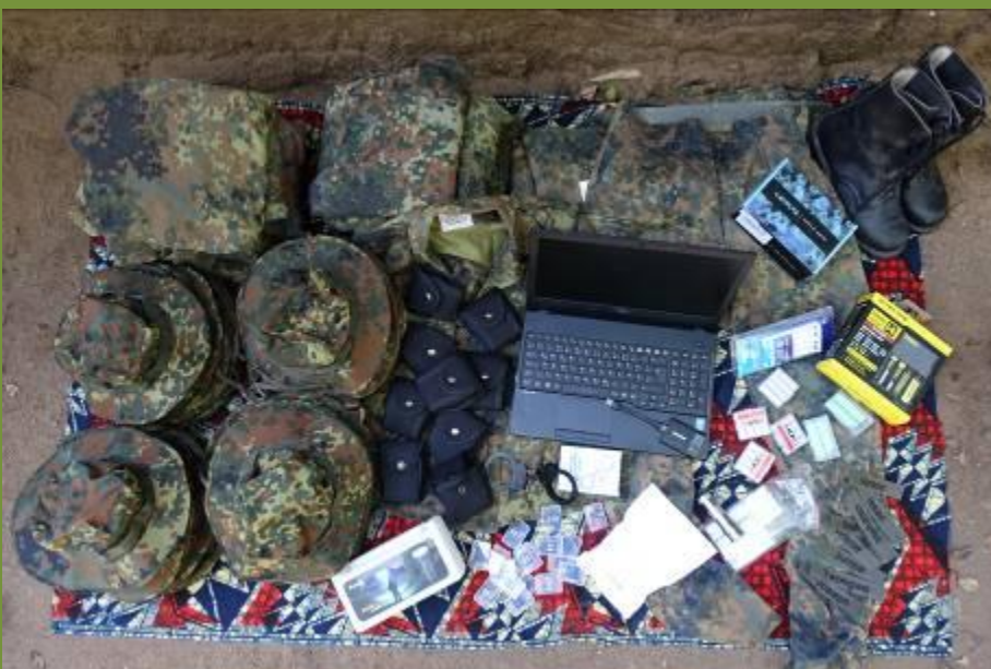
Some donations received from REA