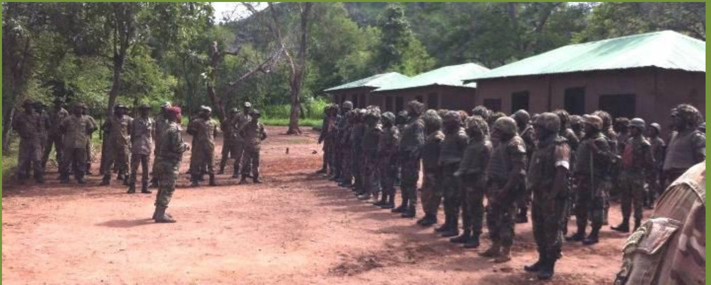
Malawi Defence Force training in Thuma alongside WAG scouts.