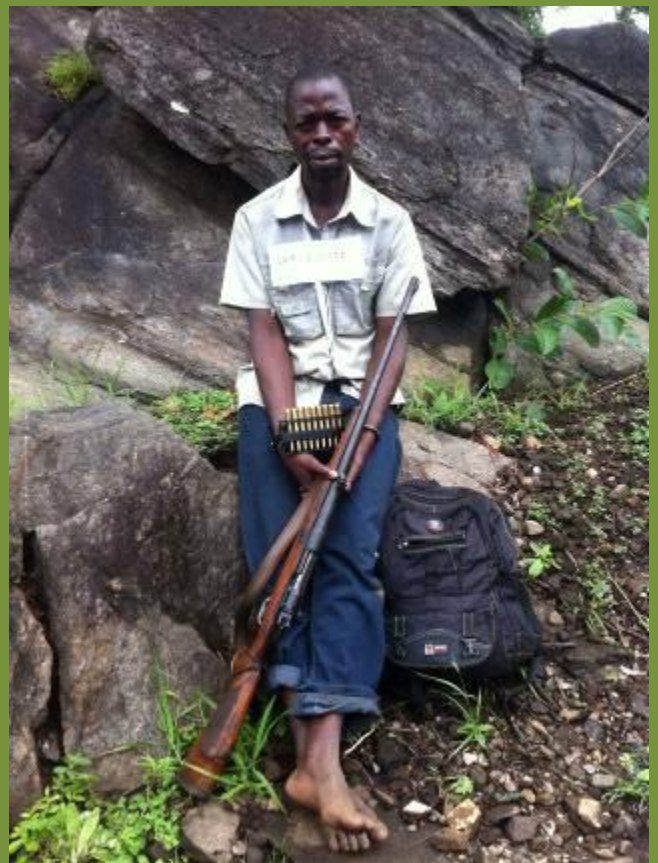
Above - Two arrested dealing in ivory. One elephant killed, but they were sentenced for 7 years.