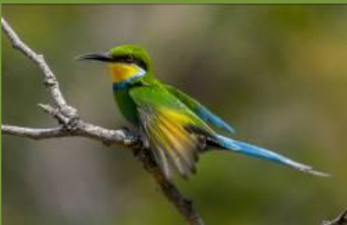
SWALLOW TAIL BEE EATER